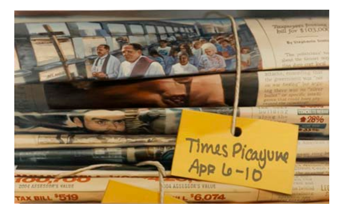
(L) March – April 2003, L.T., 2003, oil on canvas, 52 x 76 inches (Fragmentary Views series) (R) April 2004, T.P., 2007, oil on canvas, 48 x 78 inches (Fragmentary Views series)