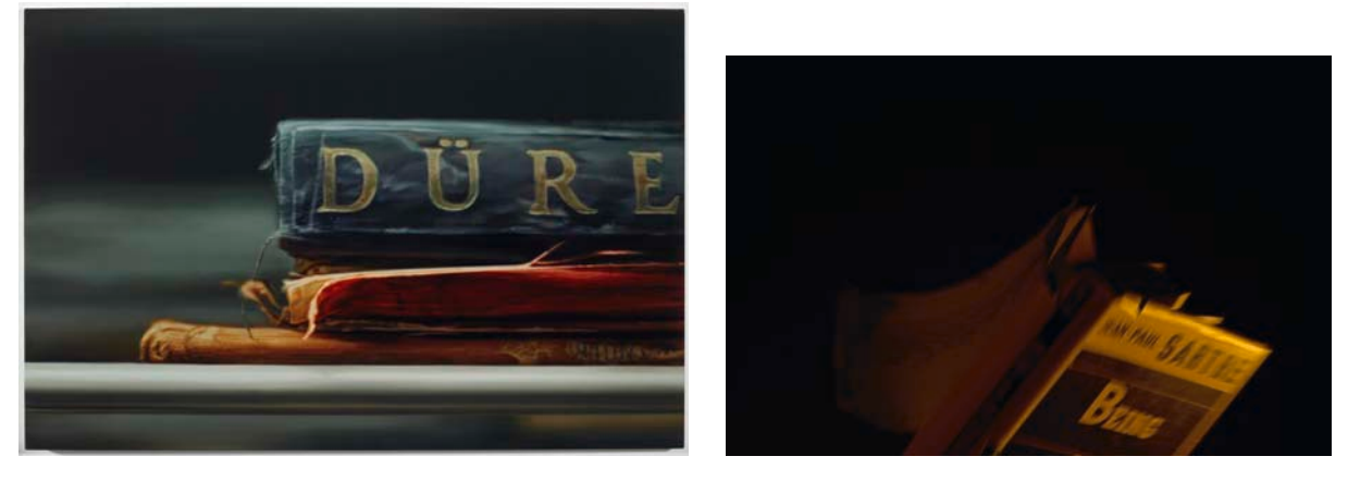
(L) The Metropolitan Museum of Art Library (Dürer), 2006, oil on canvas, 48 x 72 inches (Museum Library series) (R) Untitled (Being and Nothingness No. 1), 2007, digital print, 23 5/8 x 35 3/8 inches (Untitled [Modern Books])